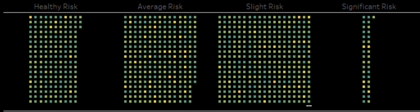
Total Percentage of Customers Per Risk Segment

Healthy Risk: 20.9% Average Risk: 30.4% Slight Risk: 44.5% Significant Risk: 4.2%